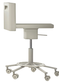
Matt colour Light Grey 1707 C