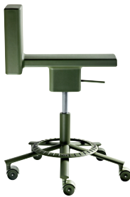
Matt colour Olive Green 1551 C