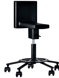
Matt colour Black 1764 C