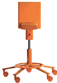
Matt colour Orange 1658 C